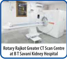
Rotary Rajkot Greater CT Scan Centre at B T Savani Kidney Hospital