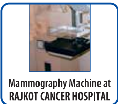
Mammography Machine at RAJKOT CANCER HOSPITAL