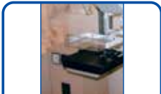
Mammography Machine at RAJKOT CANCER HOSPITAL