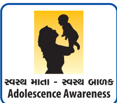
स्वस्थ माता - स्वस्थ बालक Adolescence Awareness