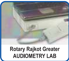
Rotary Rajkot Greater AUDIOMETRY LAB